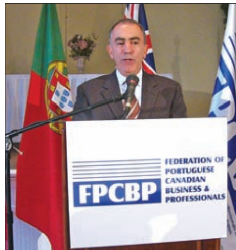
O Ministro das Finanças do Ontário, Greg Sorbara

"Se o governo for derrubado e houver novas eleições, o tema volta à estaca zero, deixando cerca de 100 a 200 mil trabal-